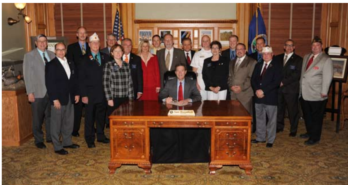
The bill-signing ceremony for HB 2078.

Pre-paid wireless communications devices: HB 2104 was introduced at the request of law enforcement officers to better enable them to tie pre-paid telephone purchases to co-conspirators in cases (e.g., drug). The bill received a hearing in the House Utilities &